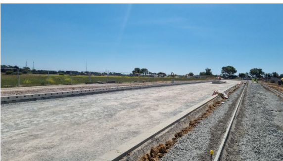
Section 2 New road construction

Works are progressing well along this section with highway drainage and