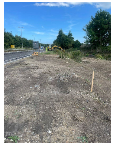
A2 Narrow Lane and Vegetation Clearance

Archaeology and targeted Unexploded Ordnance surveys have been completed within the construction areas on both sides of the A2. A World War One training trench was found north of the A2 and this will be retained and protected as part of these works.