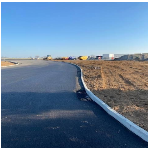
The first 120m of completed carriageway

The first 120m section of carriageway from the site entrance at B&Q roundabout, referred to as Section 2A of the phased scheme has been completed.