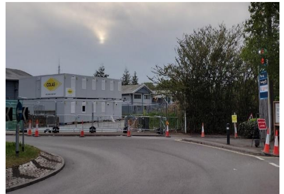
Colas Site Compound Office

The Colas site compound is constructed in Section 1B South, adjacent to the Tesco roundabout. The site compound building will be in place until Summer/Autumn 2023. Groundwork continues in this section which includes surveys and drainage, progressing towards creating an entrance to 1B North.