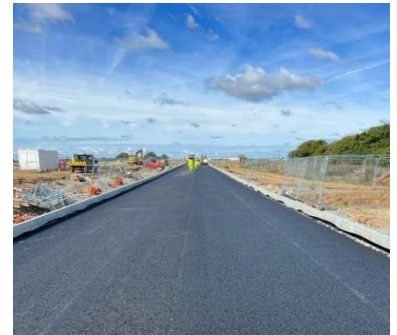
Tarmac laid in Section 2

Drainage ponds and soakaway tanks have been installed to combat flooding. Street light ducting is being installed in the new footpaths.