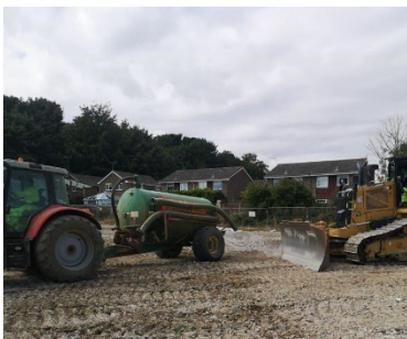
Dust Suppression North side of A2

Works continue north of the A2 on drainage works which is part of the main construction works on the new section of road.