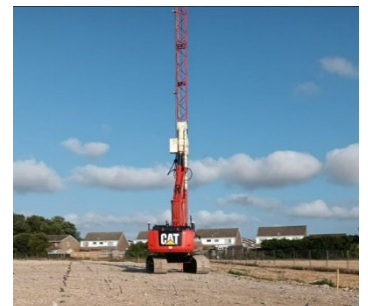
Band drain installation

Dust suppression measures are being undertaken to minimise the potential for dust nuisance.