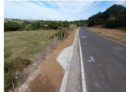
Dover Road, Phase 1 works crossing

Works on Section 3, Phase 1 finished on 20 August 2022. A re-visit with additional road closure will be required once SGN & Severn Trent Water have programmed in the necessary utility diversions. This will then enable completion of road widening works adjacent to Guston Primary School and the construction of the new bus layby at Burgoyne Heights.