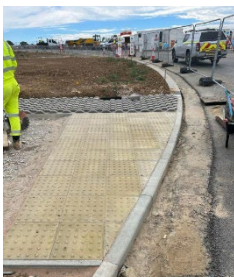
Installation of Tactile Paving with Pedestrian deterrent paving

Drainage works, kerbs and footpaths continue to be installed including the addition of tactile paving. Tarmac surfacing has been carried out on large sections of the footpaths.