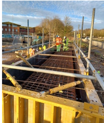
Reinforcement and Formwork

In section 1b South we have started building the bridge abutment, breaking down the concrete piles and installing the steel reinforcement so that we can install the concrete. We have also been working along the verge of the A2, backfilling the services and putting in a concrete protection slab, to improve access to site.