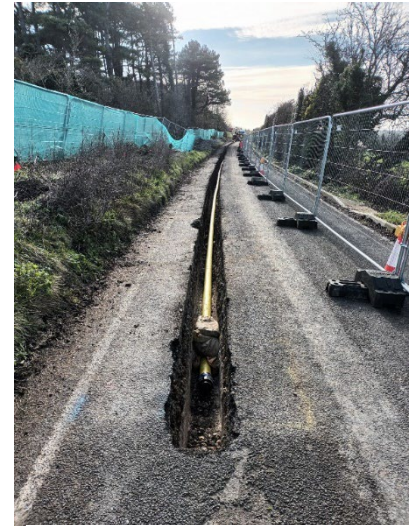
SGN Gas Works

These utility works will continue into February.