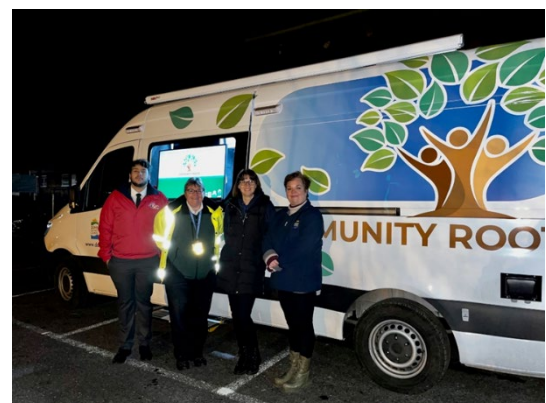
Dover District Council

On the 27 th of January we partnered with the Dover District Council in their new Community Roots Van to help young people riding on bikes and scooters without visibility lights. Our aim was to help the community wardens and social workers to educate these young people about the dangers that they were placing themselves in and Colas also provided bike lights and spoke reflectors to give to the young people.