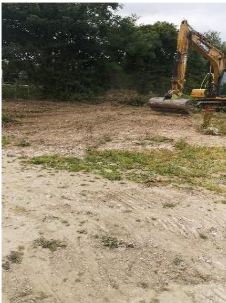
Section 1b Ground preparation

Trial holes along the verge on the A2 are taking place to ascertain the depth and position of the existing services to help in the construction of the bridge abutment.