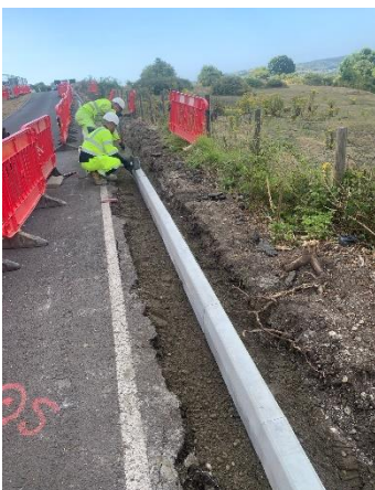
Section 3 kerb and drainage works on northbound verge near Guston Primary School.

Section 3 (Phase 1) commenced on 25/07/22 and a key milestone was quickly achieved by diverting a live medium pressure gas main outside the area of the new bus layby at Burgoyne Heights. This has enabled the construction of the new bus layby to commence.