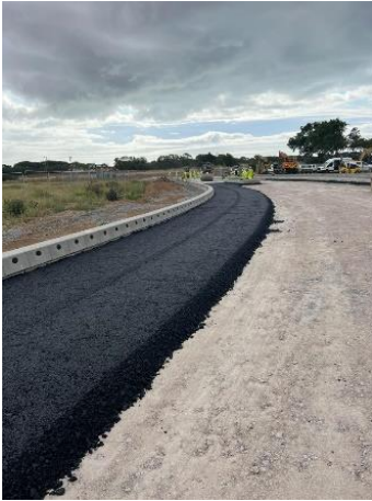
Section 2a first layer of base course

Works are progressing well along this section with further highway drainage, kerbs and footpaths being installed. Road surfacing has also been laid up to the Public Right of Way ER60.